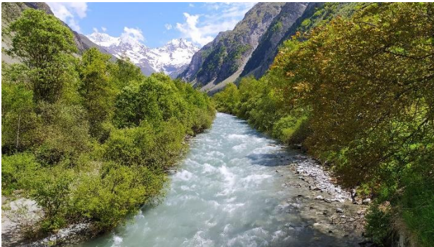
The Séveraise river.

In a plebiscite manner the 5 th edition of this particular workshop offers juniors to i) present and discuss , and ii) hands-on practice of various measuring principles in a setting that gives more opportunity to learn and to share compared to regular conferences.