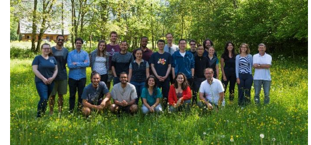
Participants during the EJSW 2022 edition in Saint Maurice.

The 26 th EJSW will not only offer junior scientists an opportunity to present their research work and to be trained in chairing sessions as usual EJSWs, but will also put forward a unique set of practice sessions lead by the Organising Committee.